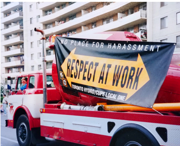
Local One wins the right to refuse harassment in 1992, almost 20 years before it became the law in Ontario.