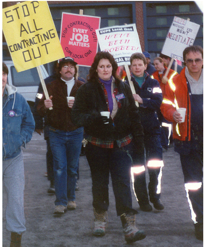
Simultaneous picket at Hydro depot by Hourly Unit members in solidarity with meter readers. At noon, Hourly Unit trucks rumbled by Head Office (a popular 'drive-by' tactic) with a message for Hydro Commissioners arriving for a meeting.