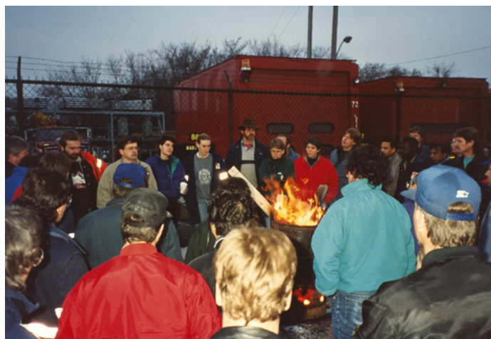
Serious meeting at dusk in the 1989 strike – Local One flying squads

In 1999 Local One played an important role in defeating Mike Harris’s draconian Bill 136, a huge threat to Local One. At the time, we faced the task of harmonizing collective agreements from six former utilities that had been amalgamated into a new Toronto Hydro. Bill 136 sought to throw out existing collective agreements of unions in our situation and force us into first contract arbitration, essentially starting over. Local One waged a successful three-week strike that was an important contribution to the province-wide campaign that defeated Harris’s scheme.