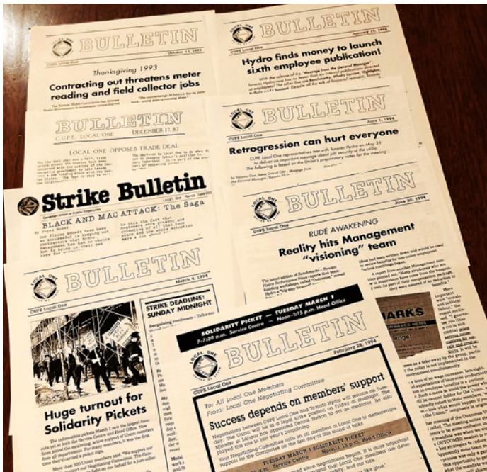
Local One's agitational newsletter challenged employer propaganda and 'fanned the flames.'