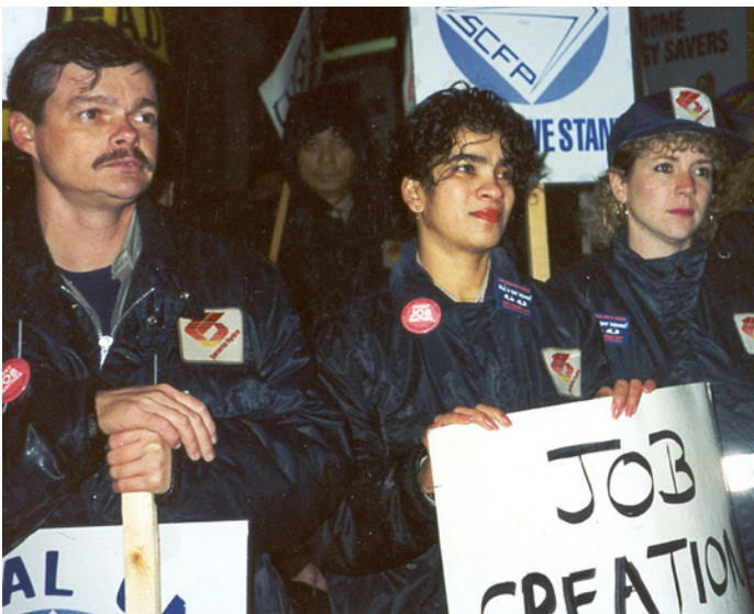
Early morning picket at Hydro's Head Office by meter readers in the Salaried Unit in 1994. Although guaranteed continued employment, they fought contracting out of their jobs. "Say yes to steady jobs!" "Cutbacks in services hurt us all!" "Job creation NOT job elimination!" "Every job matters"