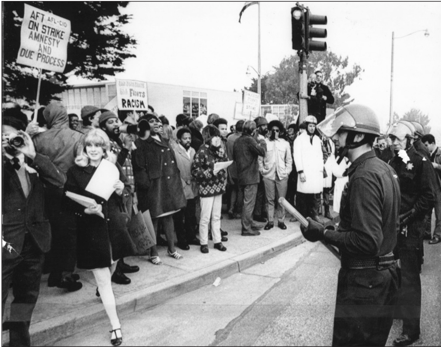
Holloway Avenue, 1968: During the San Francisco State strike, students gathered every morning and faced the police. During course of the strike over 850 were arrested and expelled. Faculty, who belonged to an AFT local and supported the strike, were fired. Notice sign on the left, calling for amnesty and due process.